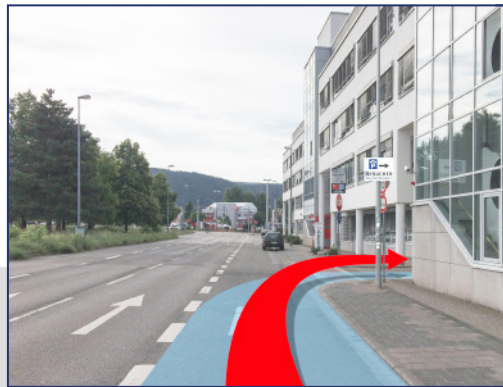
View Arrival from Czernyring